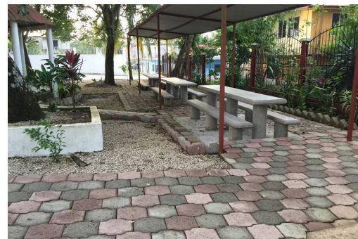
Waiting area for families

From the bottom of our hearts, thank you for walking with us on this amazing journey!