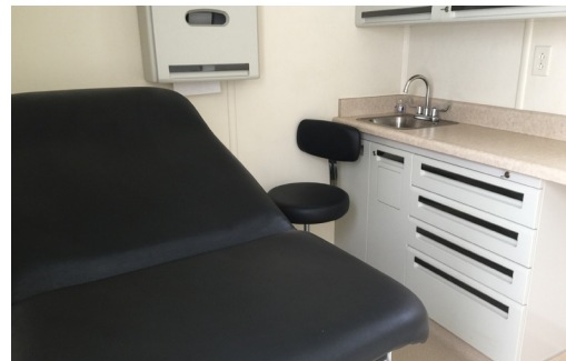
Exam room (top), maternity care (bottom)